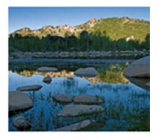
Public Employees' Benefits Program 901 S. Stewart Street, Suite 1001 Carson City, Nevada 89701